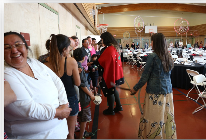
A dah ney ba goh tsay az to dilh "Following the Path of Our Ancestors"