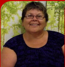
Aileen Prince Chair