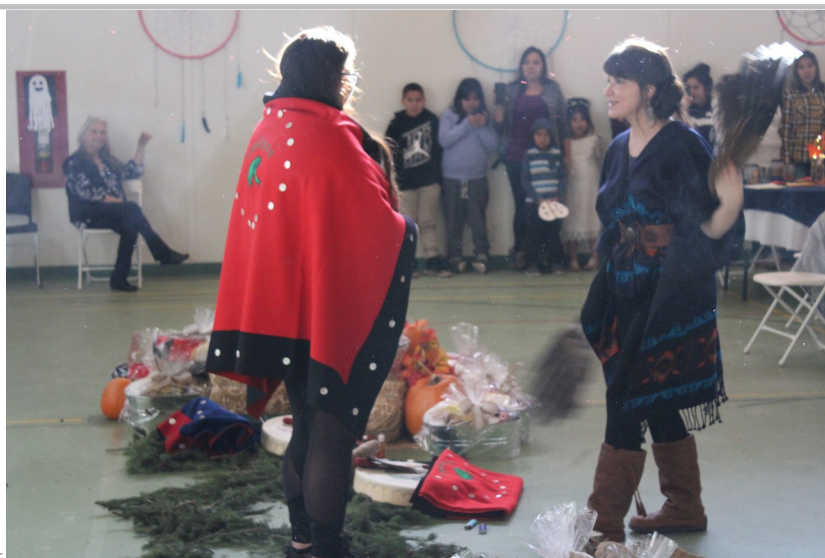
Nedusneke-ne Dax on Hais Gvahn – Following the Trail of Our Ancestors”

Tsibalyan T’o Eagles Nest, Monday - Thursday