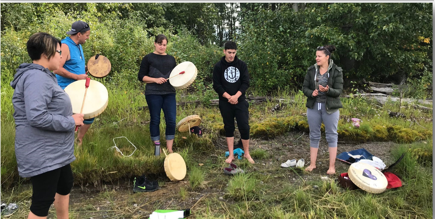
Nedusneke-ne BuK'oh Nuts'oodilh "Following the Path of Our Ancestors"

'Alhgoh 'Uts'ut'en , Fridays, 11:30 am - 2:00 pm